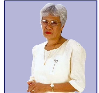
Parents and carers