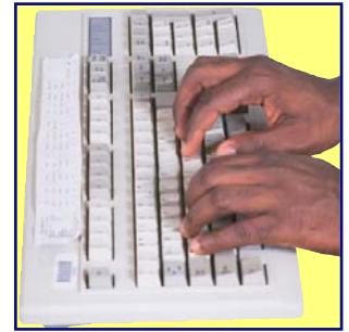
choice and activities