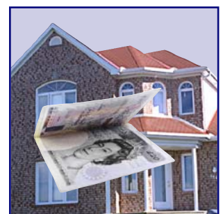
Costs of residential care